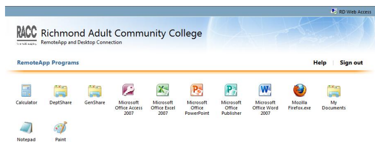
Figure 2 RACC Resources available